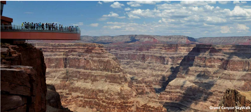
Grand Canyon SkyWalk

region of contrasts, from the Mojave Desert at 2,000 feet to the 10,000-foot Pine Valley Mountains. The crown jewel of the area is Zion National Park , one of the oldest & most scenic National Parks in the United States. Enter the park in Springdale and experience a Zion Park Tram Tour to view the spectacular combination of multicolored canyons, sheer cliffs, streams, waterfalls and foliage that are all part of this beautiful park's backdrop. Later visit the historic Zion Lodge, the hub of this wonderful National Park. After your Zion experience, enjoy a Farewell Dinner at a local restaurant in the Zion Park area. After dinner return to Mesquite.