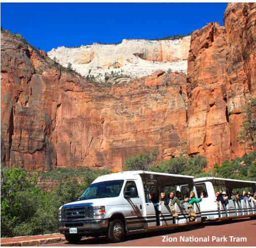
Zion National Park Tram