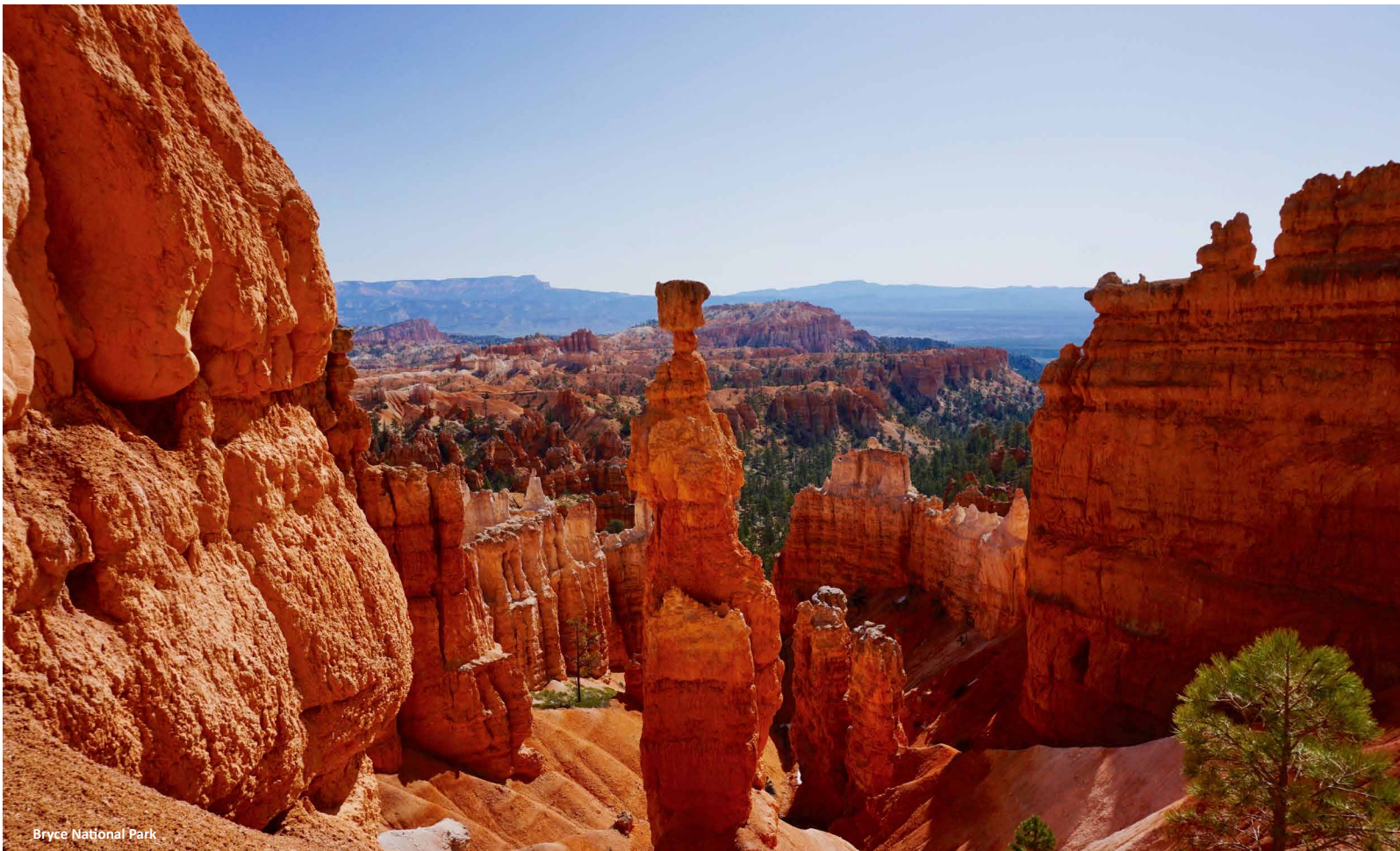
Bryce National Park